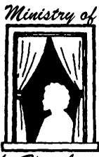
Ministry of the Homebound

As a community of Christian believers, we have the privilege, obligation and joy of gathering every Sunday to hear God's word and to offer praise and thanksgiving to God in the name of Christ through the Eucharist. In these holy actions, we are united by the Holy Spirit and formed more perfectly into the Body of Christ through the celebration of the Mass.